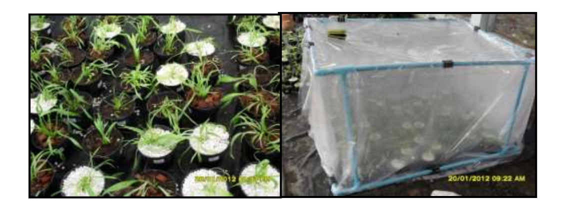
Figure 3. Plantlets in greenhouse non-cover and covering with plastic sheets