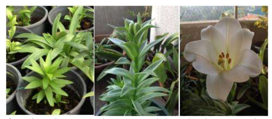
Figure 4. L. formolongo growth (a) A rooted shoot (b) plants grown in pot kept outdoors for 4 months (c, d) tissue culture plants grown for more than 1 year